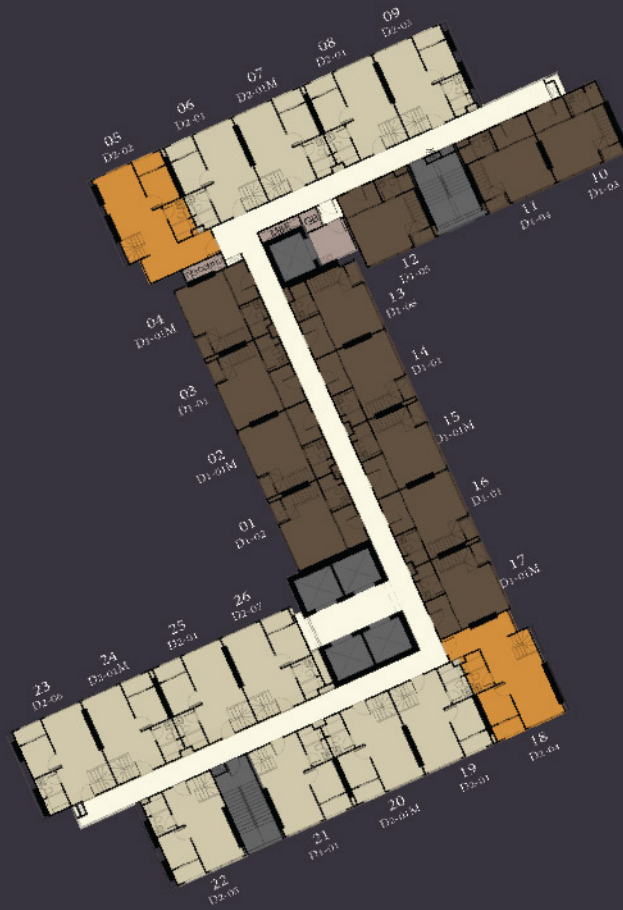
DUO SPACE PLAN FLOOR 24-42