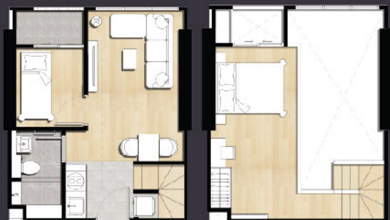
LOWER 30.5 SQ.M.