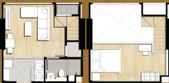
LOWER 25.5 SQ.M.