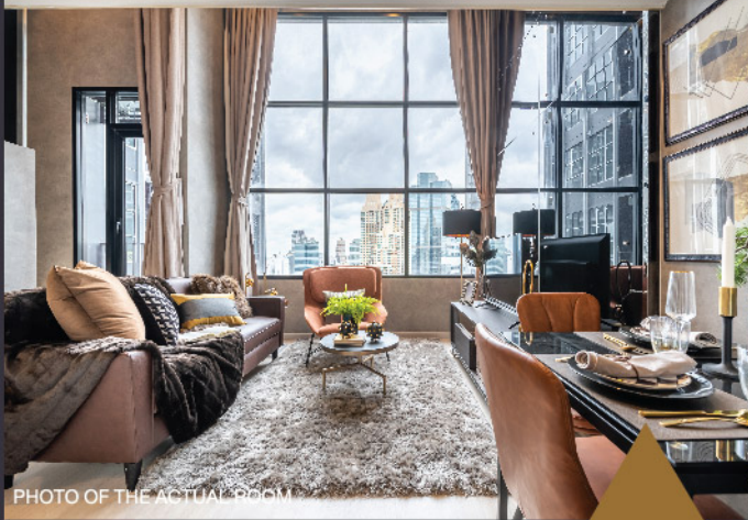
PHOTO OF THE ACTUAL ROOM